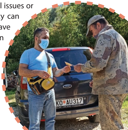
Despite obstacles over the years, such as the COVID-19 pandemic, the effort to spread tracts across Montenegro continues.

Through the years, we have learned that the Montenegrin community may be polite and welcoming but very private when it comes to personal issues or problems. Additionally, nationality can be a problem. Even though I have lived in Montenegro for more than 30 years, the nationals will never consider me a Montenegrin. In their eyes, I am a foreigner and