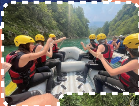
Besides Bible lessons, teen camp involves activities such as rafting and hiking.