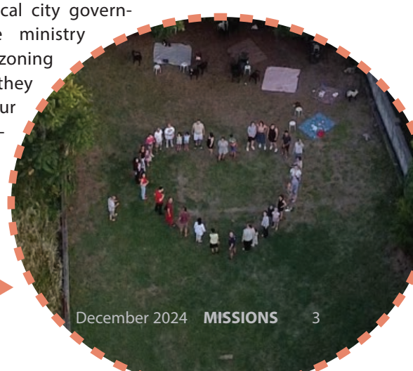
The whole assembly, kids and adults alike, helps on moving day; The Podgorica assembly sends love from its property.

About six years ago, God enabled us to purchase land in a prime part of Podgorica. We would be very happy if we could say that we already started building our own facility. We had high hopes that construction would start a few years ago when the local city government and state ministry responsible for zoning plans promised they would work on our request. Nothing came of it, and then, the political party in power lost its